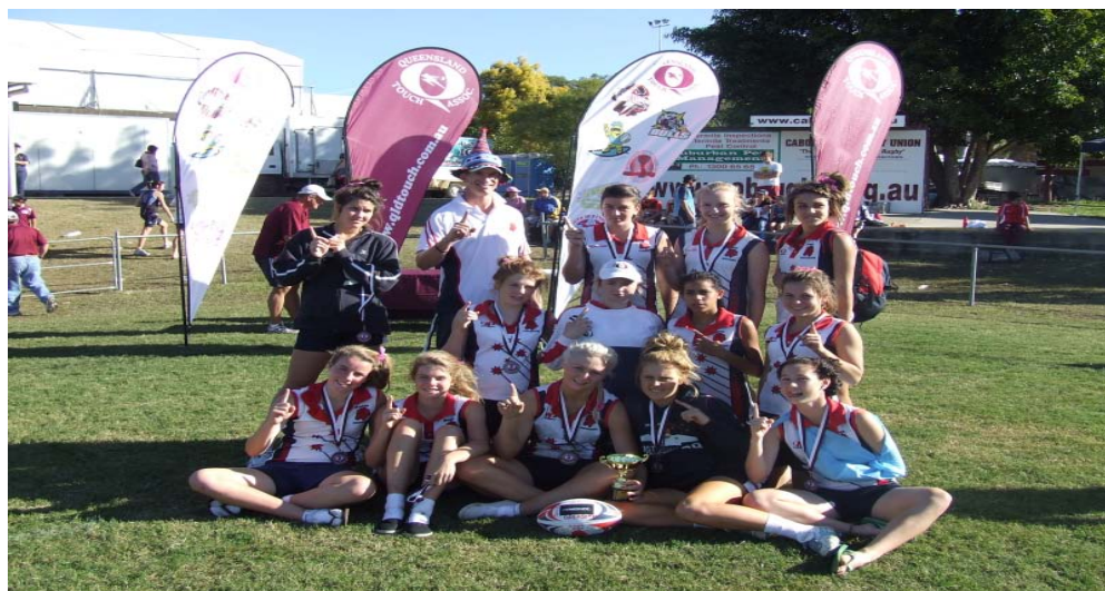
BMTA Mustangs U16 Girls Junior State Cup Champions 2009