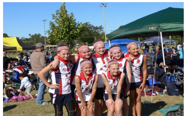
BMTA Mustangs Under 12 Girls